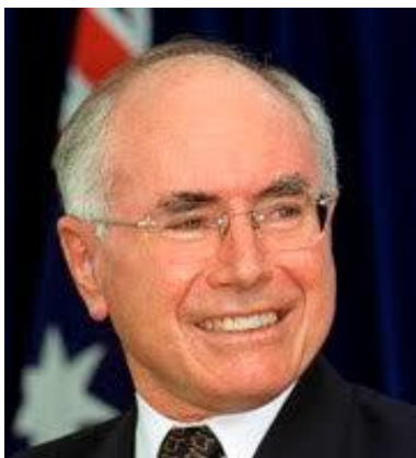
Honourable John Howard AC