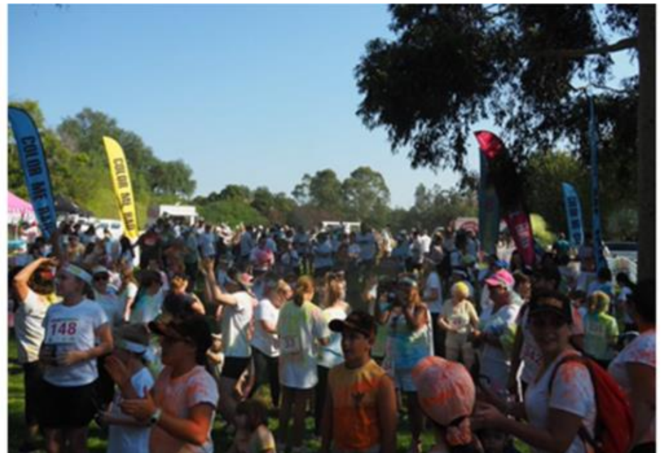
Bairnsdale Apex Club (Vic) – The Colour Ya World event was fun run of 5kms with the throwing of powdered colour along the course and at the finish line. The project aims to bring the community together and promote local running tracks and exercise and improve the quality of family relationships.

APEX CHARITABLE TRUST Grants totalling $118K were made to a range of causes during the year, with the Board looking for practical applications rather than research. The causes of melanoma, diabetes, cancer and autism were supported through grants made respectively to Melanoma Patients Australia, Juvenile Diabetes Research, Tour de Cure, Bloomhill Cancer Care, Yurana Children's Cancer and Aspect. In addition, children's reading and development was supported through a grant to Raising Literacy.