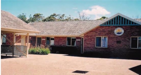
The SHACK is a complex of six, 2-bedroom holiday units

The SHACK offers families respite from the everyday demands of caring for a child or children living with chronic illness or disability. Opened in 1992, the SHACK comprises six fully furnished units, each with two bedrooms, private bathroom facilities, a self-contained kitchen and a lounge room. The SHACK is located 150km south of Sydney, at Shoalhaven Heads, across the road from the beach. The SHACK offers respite to families at a cost heavily subsidised by the Apex Foundation. After thirty years of operation, we seek your help in purchasing the much-needed replacement beds for each unit.