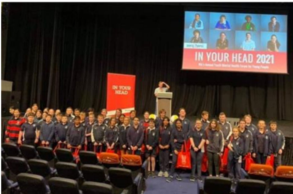
Wongan Hills Apex Club (WA) – A grant was given to the students of Wongan Hills District High School to attend a Youth Mental Health Forum, zero2hero in September 2021